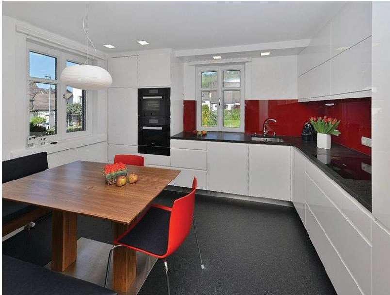
Figure 1: Kitchen counter