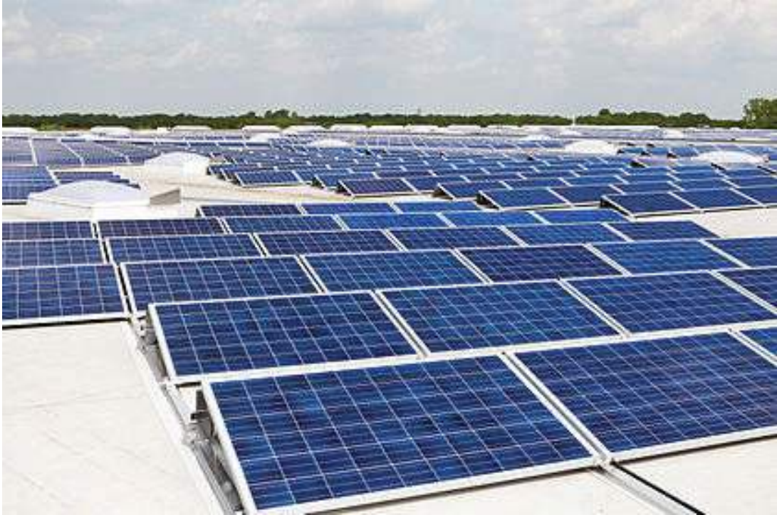
Figure 7: Solar panels