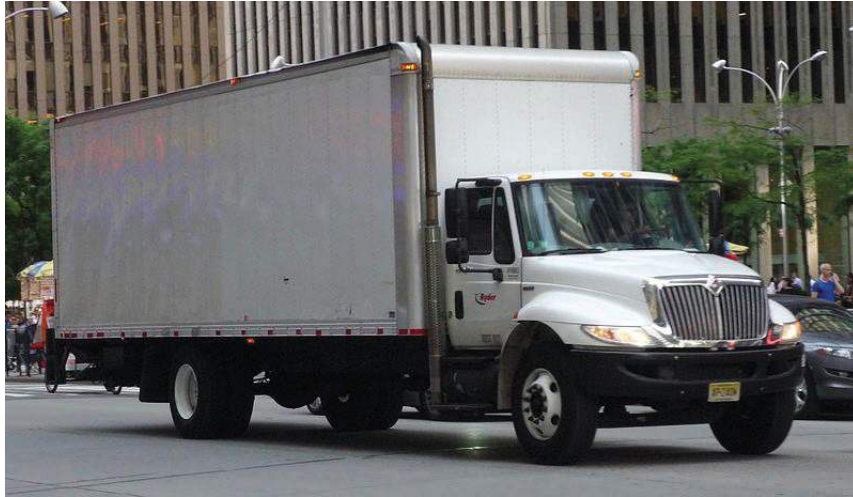
Figure 3: Large truck braking system